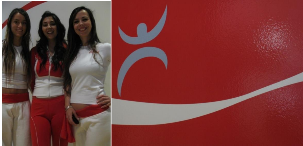
Santiago 2009. Here is the ‘flag of Cokeistan’ and the Coke lovelies, strutting their curves and exposing their bellies for the delight of susceptible delegates

A lot of progress had been made by sponsors between 2003 and 2009. The Coke people organised two of the lunchtime satellite symposia, both with free lunches, both given full-page advertisements in the programme. One was on hydration, health and well-being, the other was on exercise as medicine. The elegant Beverage Institute insignia, which was everywhere, I see as the flag of Cokeistan. The soccer World Cup... the Olympics... could a cash-strapped country or state change its name to that of its sponsor? Why not? Countries and states are named after people – Bolivia, Colombia, Rhodesia as was; and Victoria, Alberta, Queensland, Washington, Virginia, Louisiana, Pennsylvania, Tasmania... Why not corporations? Remember you read this here first. What was new since Acapulco, was the hiring of lovelies (above, left) to advertise Coke. Maybe some were nutrition students.