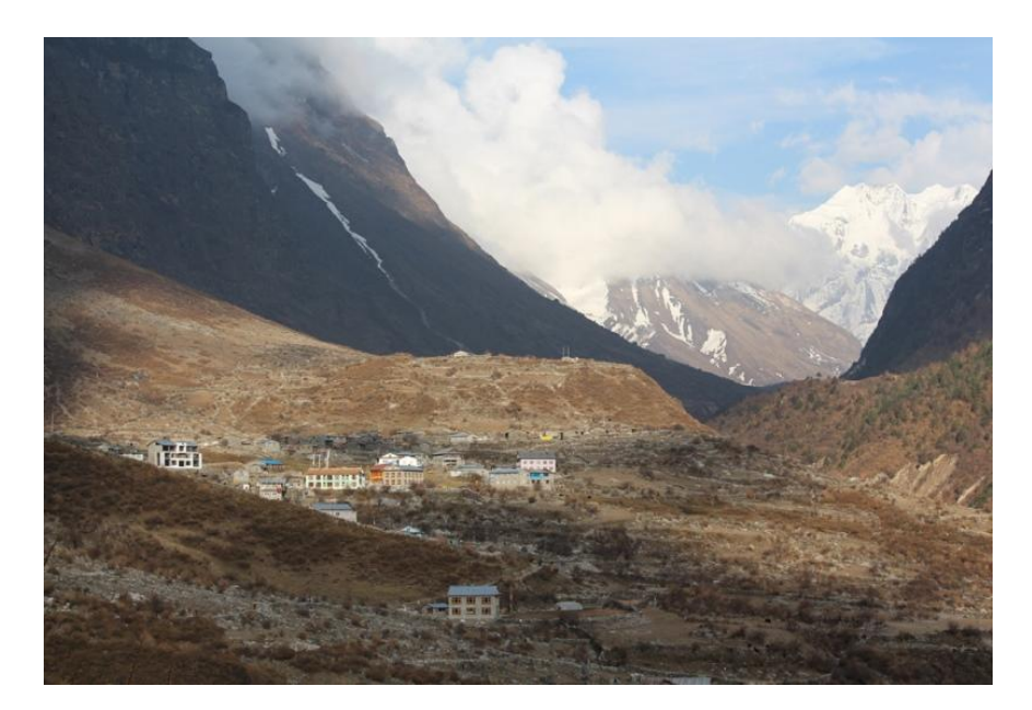
Recently built tourist hotels and resting houses can be seen here within Langtang village. They were all destroyed in the April avalanche