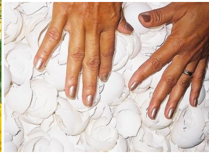
Two ingredients of multimistura. Dried and then powdered mandioca (cassava) leaves, and powdered eggshells. Unsafe, unclean? There is no record of anybody using multimistura coming to any harm

So why the hostility? Well, multimistura cannot be patented, simply because it is made from food. The drug and commercial supplement industries don't like that. No ching, ching. Its composition varies, just like that of any freshly made dish and meal, and like home cooking it is typically made by hand. This makes food safety regulators anxious. Unclean, unclean! One of its ingredients is powdered eggshell, and we all know that chickens are often infected with salmonella. Plus its principal use is to protect the health of children, including as treatment of moderate and severe undernutrition, and sometimes even marasmus. This alarms the medical profession. Dangerous, dangerous! But subject to correction, there are no substantiated cases of children coming to serious harm because of being fed multimistura .