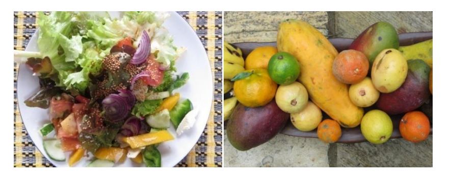
The Daniel fast is raw vegan. It is great! My variation is mainly salads and fruits and other plant food. I exclude all grains, and include very delicious items like tahini — and my magic multimixture